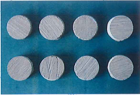
Fig.1 Appearance inspection before the test-front side