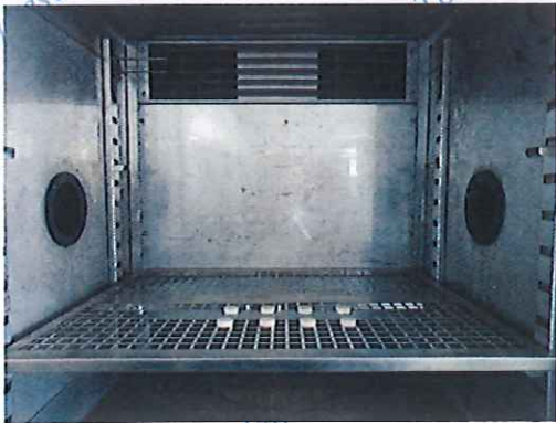
Fig.5 Sample placement