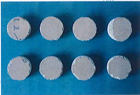
Fig.3 Appearance inspection before the test-back side