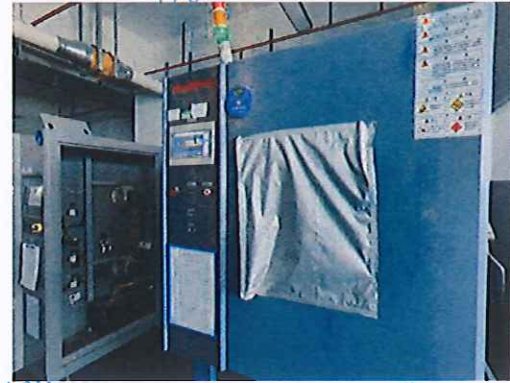
Fig.6 Equipment photo