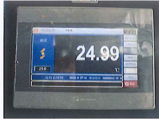
Fig.7 Test interface