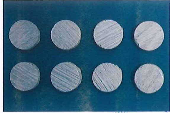
Fig.2 Appearance inspection after the test-front side